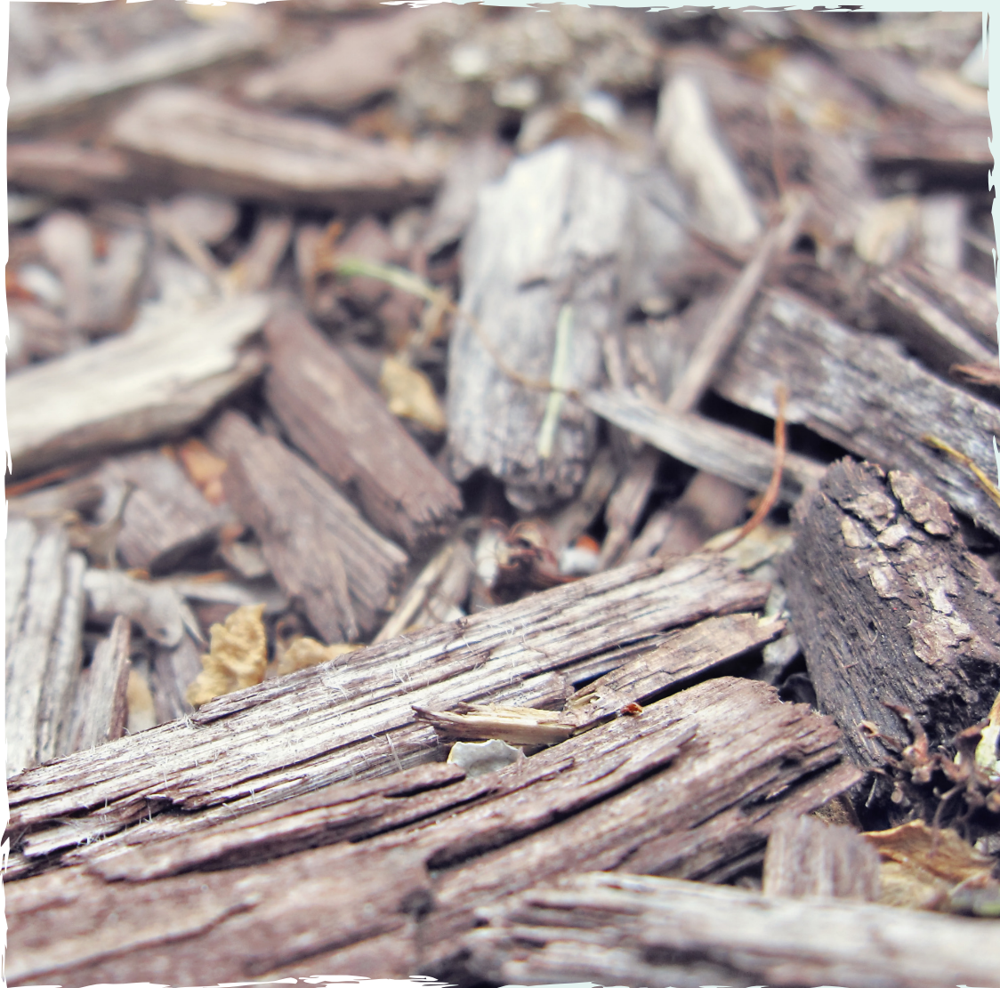
BIOMASS: Low-carbon liquid fuels made from biomass are sustainable liquid fuels with no or very limited net CO 2 emissions during their production and use compared to fossil-based fuels.

The EU refining industry stands ready to step up collaboration with other industries and with EU policymakers, to take bold climate action together. In order to deliver climate neutral transport by 2050, we urge EU policymakers to establish a high-level dialogue in 2020 with all concerned stakeholders to create the necessary policy framework. The following key policy principles are central to delivering our 2050 climate-neutral ambition and should serve as a starting point for discussion: